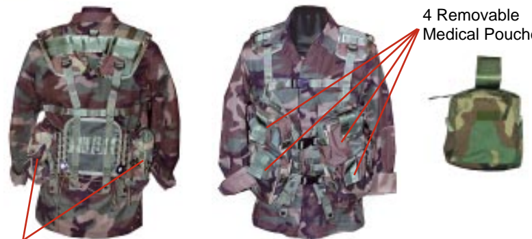
4 Removable Medical Pouches