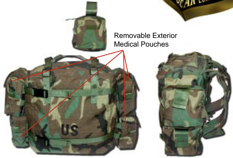
Removable Exterior Medical Pouches

Unfilled MOLLE Medic Bag $285.00 Filled MOLLE Medic Bag $784.95