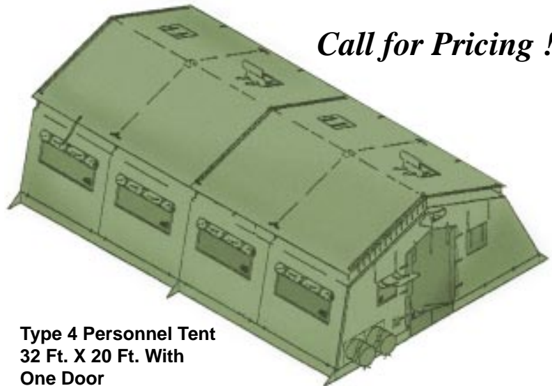
Type 4 Personnel Tent 32 Ft. X 20 Ft. With One Door